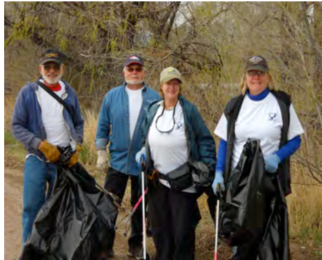
Friends of Barr Lake joined 20 other BMW volunteers, including members of DU's Zeta Beta Tau fraternity, at the Greenway Foundation's River Clean Up Day, April 23.